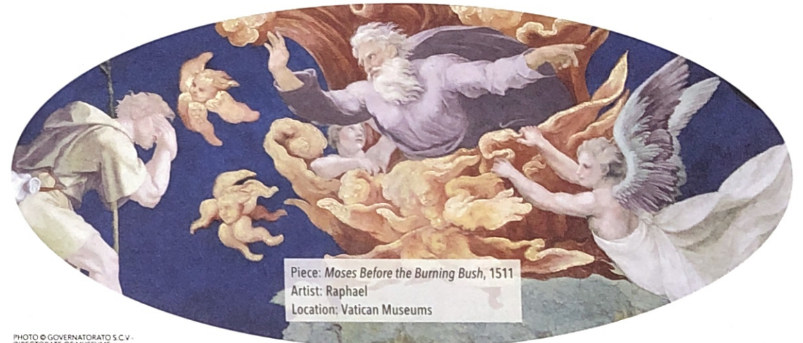
Piece: Moses Before the Burning Bush, 1511 Artist: Raphael Location: Vatican Museums

Do I fully appreciate the implications of the resurrection of the body as an element of my faith?